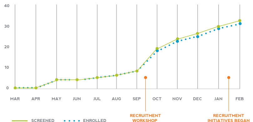
Impact of Recruitment Program on Monthly Enrollment Increases